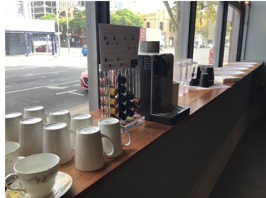
Self Service Nespresso

Add $300 to hire out our entire venue 9am - 4pm with 20+ participants booked in conjunction with package. Incl Projector + screen. Valid Mon - Fri.