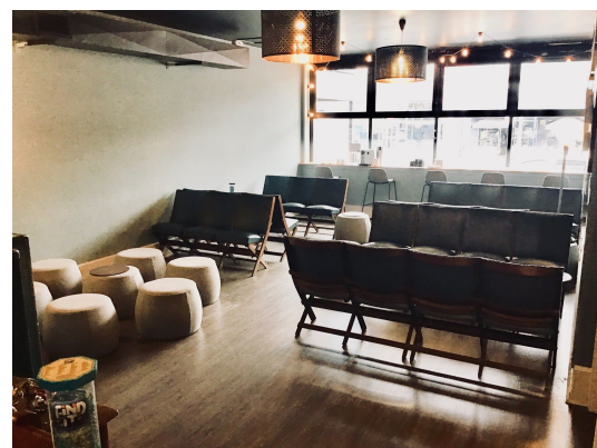
Relaxed or banquet seating